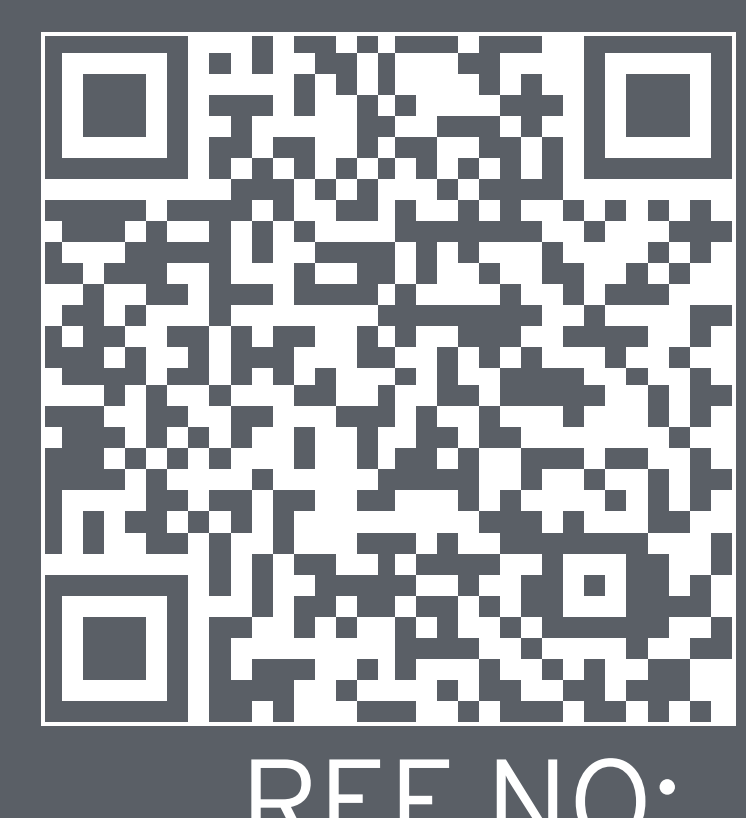
REF NO: 006931

This shop situated at street level in a prime site. This property comprises one room at street level measuring approx. 28 sqm and an upper level room of 28 sqm plus airspace. Contact us for further details.