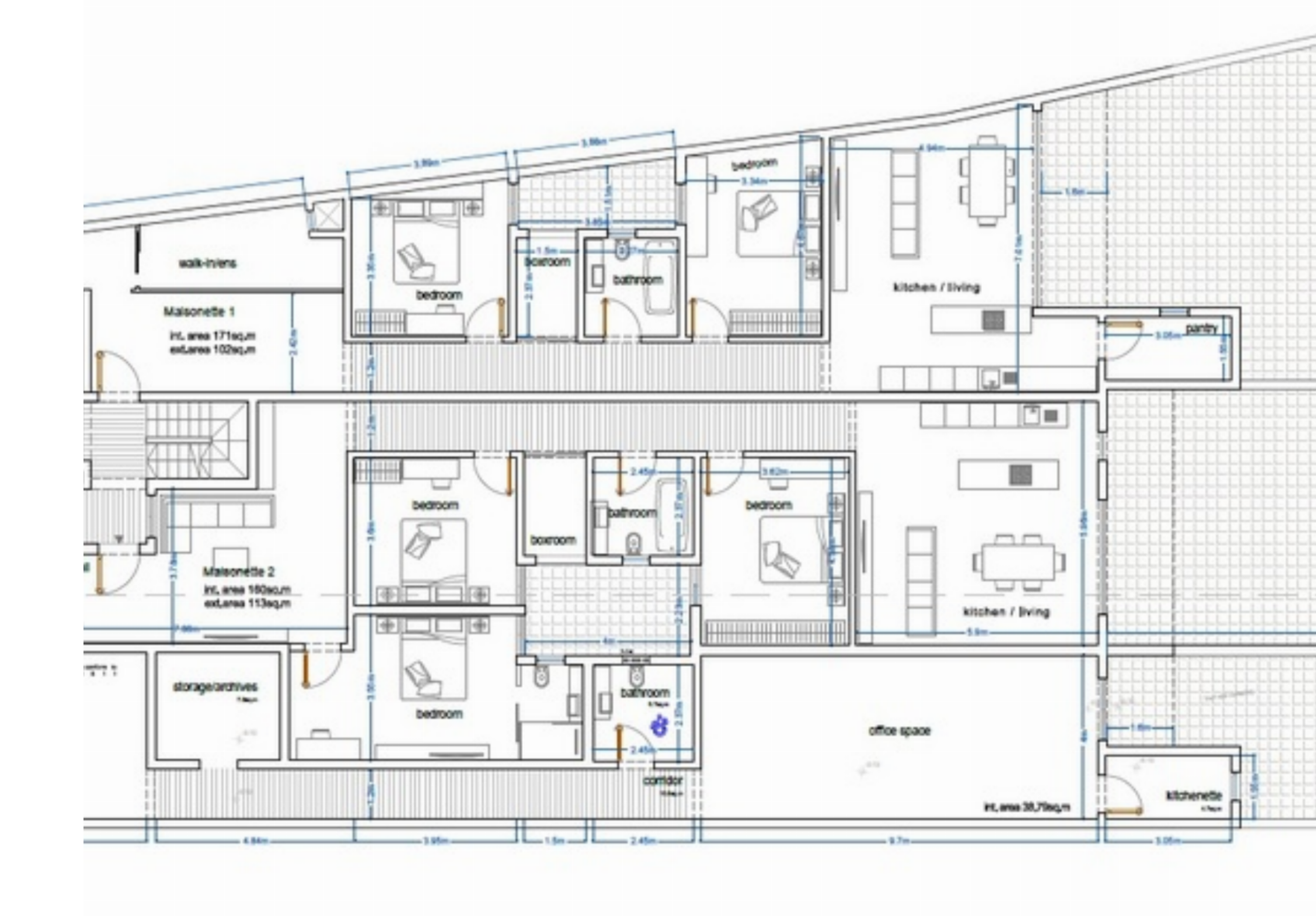
ind floor level

Three Bedroom MAISONETTE located on a prominent street in this rural village which is centrally located overlooking a green area. Layout consists of an open plan living/dining, kitchen/breakfast and a pantry leading to a spacious yard with pool, 3 bedrooms (main with en-suite and walk-in wardrobe), main bathroom and a utility room. Optional garages available. Property is being sold highly finished excluding internal doors and bathrooms. Completion date December 2021.